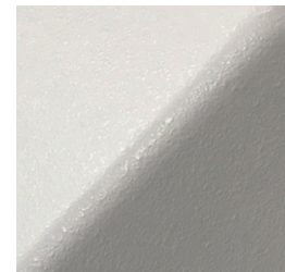
Typical White FRP Finish